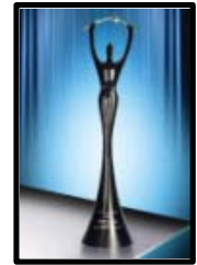
Elektra Award 2005