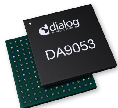
VFPGA 7 mm x 7 mm, 0.5 mm pitch and VFPGA 11 mm x 11 mm, 0.8 mm pitch package, consumer and automotive grade options

An integrated 10-channel general purpose ADC includes support for a touch screen controller with pen down detect, programmable high/low thresholds, an integrated current source for resistive measurements, and system voltage monitoring with a programmable low-voltage warning. The ADC has 8-bit resolution in auto-mode and 10-bit resolution in manual conversion mode.