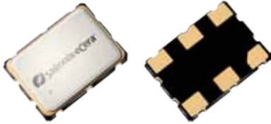
7.0 x 5.0mm Ceramic SMD