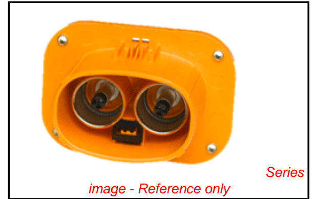
image - Reference only

Application Specification AS-171467-001 Product Specification PS-171467-001 Sales Drawing SD-171467-1000, SD-171467-1100, SD-171467-1200