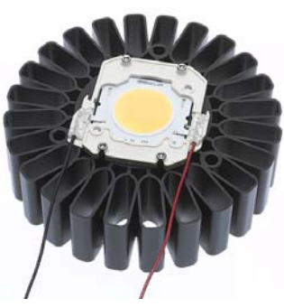
LED Array Holder Mounted to Heat Sink for Bridgelux* RS Arrays (Heat sink sold separately)