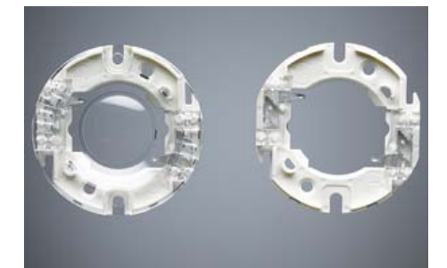
LED Array Holder for Bridgelux* ES Array