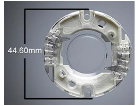
LED Array Holder for Bridgelux* ES Arrays