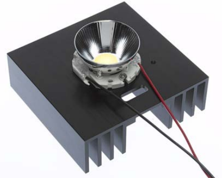
LED Array Holder with Optic for Bridgelux* ES Arrays (optic sold separately from LEDIL)