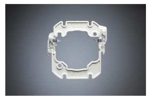
LED Array Holder for Bridgelux* RS Array