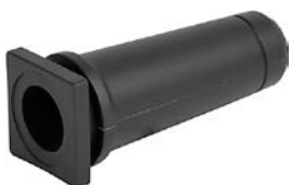
Cable Guard KT14 PVC Cable Guard for rewireable connectors