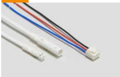
Power Cable Assemblies (1)