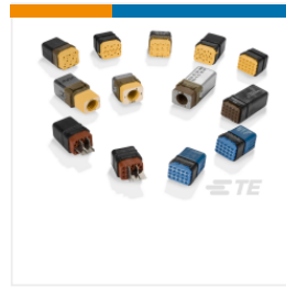
DMC-M 01-08 BN DMC-M 01-08 BN