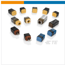
DMC-M 20-22 PN DMC-M 20-22 PN