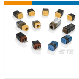
DMC-M 08-16 SN DMC-M 08-16 SN